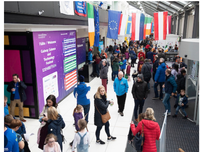
Lobby + Reception